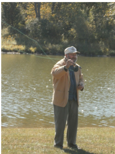
The Southern Catskill Anglers were back instructing the students on spin and fly casting techniques.