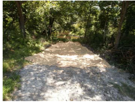
A rolled erosion control product (RECP) was used to stabilize the soil over this trench through the woods. The trench carries a drainage pipe from the nearby crop field to a stream. The RECP ensures that the area doesn't wash out before grass cover becomes well established.