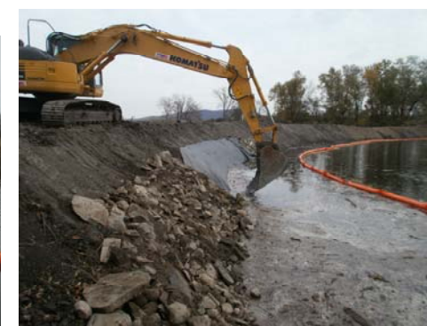
Once the bank was graded and geotextile put down, rock was used to stabilize it. Notice how clean the water is on the other side of the curtain. After the rock was put down, sod was used to cover the top and sides of the bank.