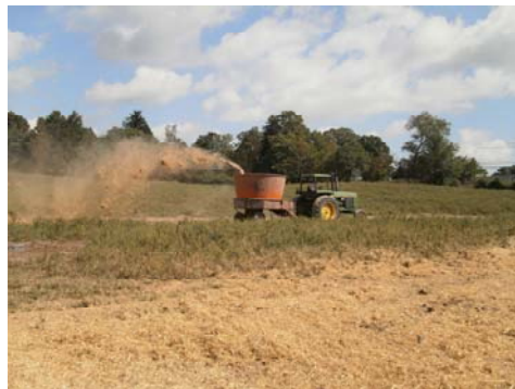
After completion of pipe installation, all disturbed areas are seeded AND stabilized for immediate protection with hay mulch.