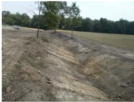
We see many open ditches that were dug for the purpose of improving cropland drainage, but due to steep banks, too much channel slope and lack of maintenance, these measures become a source of sediment to local waterways. On this Wawayanda farm, a poorly constructed ditch was re-constructed with mildly pitched side slopes that can be easily seeded and maintained by the landowner.