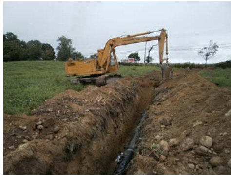
Installation of 15 inch pipe continues.