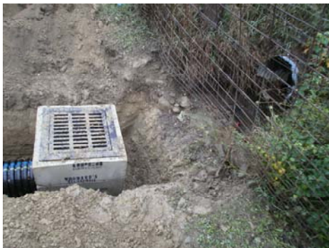
Road water from a State highway culvert previously ran through a pasture on this Town of Minisink dairy farm, causing gully erosion. A new catch basin with a 15 inch pipe outlet now conveys the road water to the bottom of the hill - protecting the pasture. The project received funding assistance from the NYS Ag Nonpoint Source Abatement and Control program (ANPSACP).