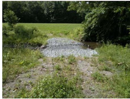
Previously, a metal culvert carried the stream under this farm access road, but had washed out to the point that it was impassable. This Geogrid stone crossing provides a trafficable stream bottom, and avoids the challenge of trying to pass large storm flows through a pipe. We have learned that these style crossings require regular maintenance (in the form of replenishing the stone), but are still a viable option for some stream crossing sites.