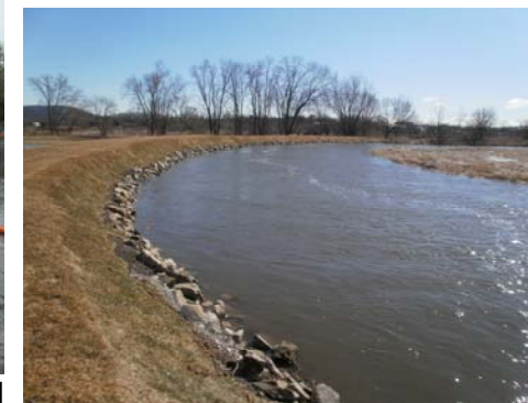
Floods came in March, 2011 and the streambank stabilization project worked well.