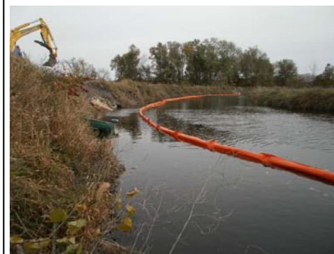
Before this 2010 project along the Pochuck Creek was started, a turbidity curtain was installed to protect the water quality.