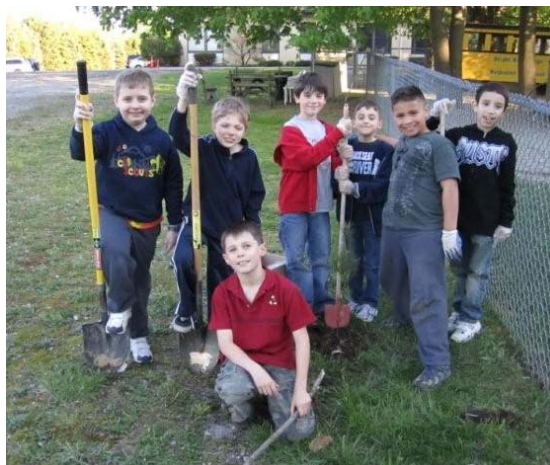
After their seedlings were planted the Scouts took time for a group photo Great job Scouts!!

THANKS to all the Scouts and adults who helped make this planting project a success.