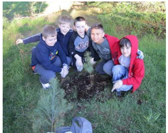
One down, more to go!

THANKS to all the Scouts and adults who helped make this planting project a success.