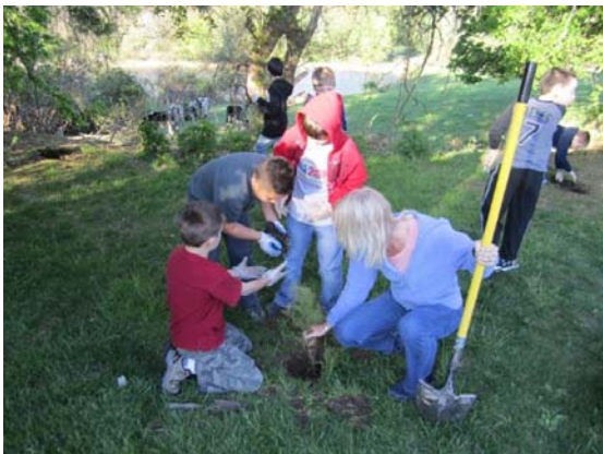
It's always nice to get the grownups involved too!

Once again this year the Cub Scouts of Den 5, Pack 77, Warwick, did a community planting project with seedlings they received from our annual tree and shrub program. Their planting project was at the Methodist Church in Warwick.